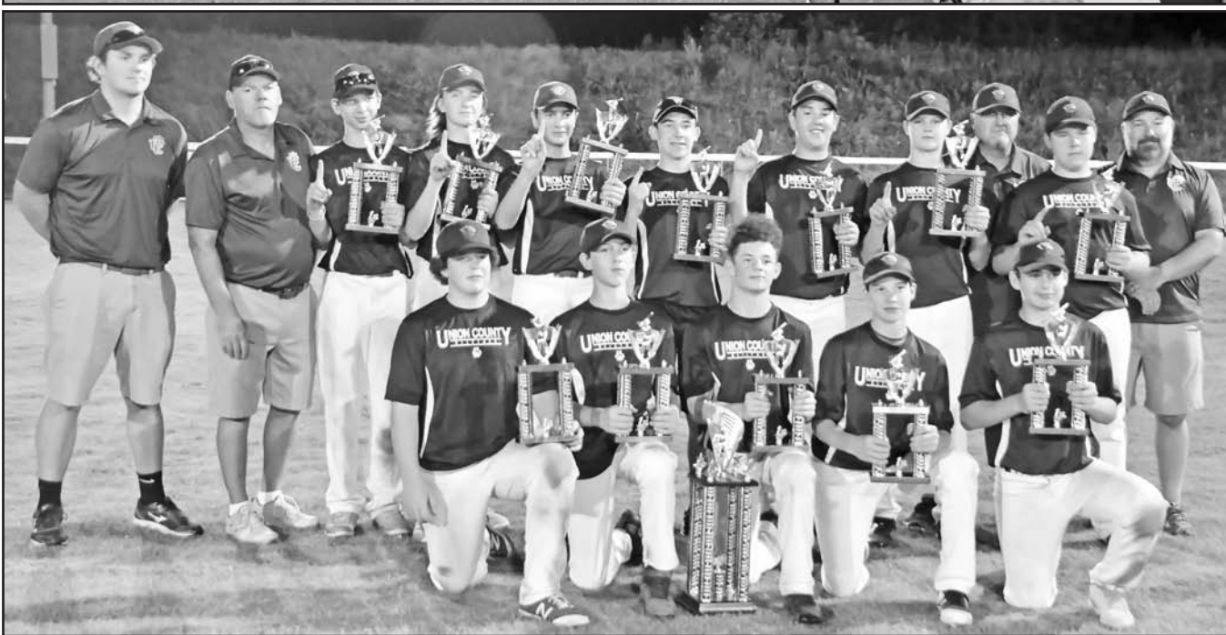
Top: Union County 10&U Softball team following its District title-clinching, 12-1 victory over Jefferson at the Fannin County Recreation Department on Tuesday. Bottom: Later that same evening, the 14&U Baseball team took care of business in their title game by knocking off the host team Gilmer, also by a 12-1 score, at the Clear Creek Complex.