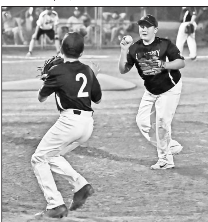
The Union County 12&U All-Stars in action vs Dawson County on Thursday night.