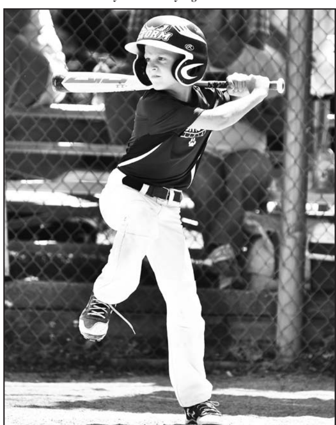
The Union County 10U Baseball team (L-R) fielding, sliding into third, and hitting during its 13-0 win over Clay County, NC on Sunday.